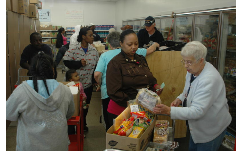
It's not a handout — it's a helping hand.

The Old Bethel pantry, occupying a former Village Pantry convenience store, is the IHI Pantry Partner in Warren Township. They serve more than Warren Township, however, having a catchment area bounded by Troy Avenue, Emerson Avenue, 56 th Street, and the Marion-Hancock county line. Prospective clients show a picture ID and establish that they live in that area. Like so many pantries, the need for their services has grown greatly, from serving 4,100 persons in December of 2008 to 7,500 in August of this year. They also anticipate providing special Christmas assistance to about 350 families.