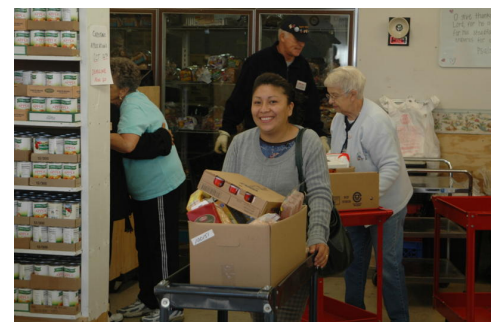
Smiles everywhere you look.

Thanks to all the volunteers at the Old Bethel Pantry Partner on the east side!